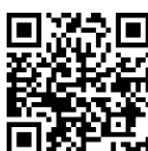
Additional Family Member